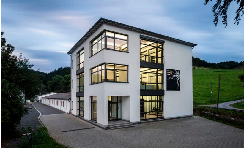
The SON-building for development, distribution and administration.

Would you like to have more information about the company or high quality images - we look forward to hearing from you!